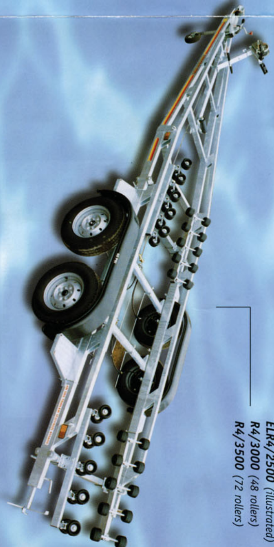
ELR4/2500 (illustrated) R4/3000 (48 rollers) R4/3500 (72 rollers)

Fully Adjustable Swing Beams, Winch Post & Axle Position. Light Board and Winch Stand