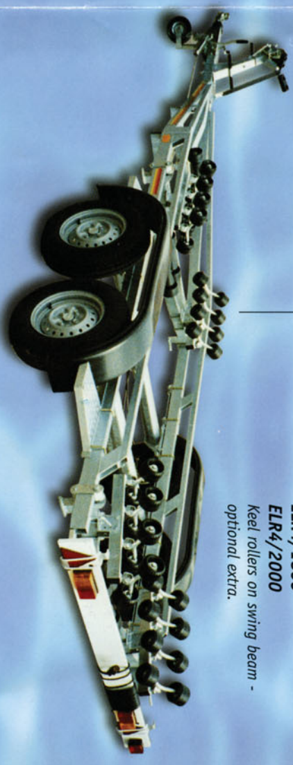
ELR4/1600 (10" wheels) ELR4/1800 ELR4/2000 Keel rollers on swing beam - optional extra.