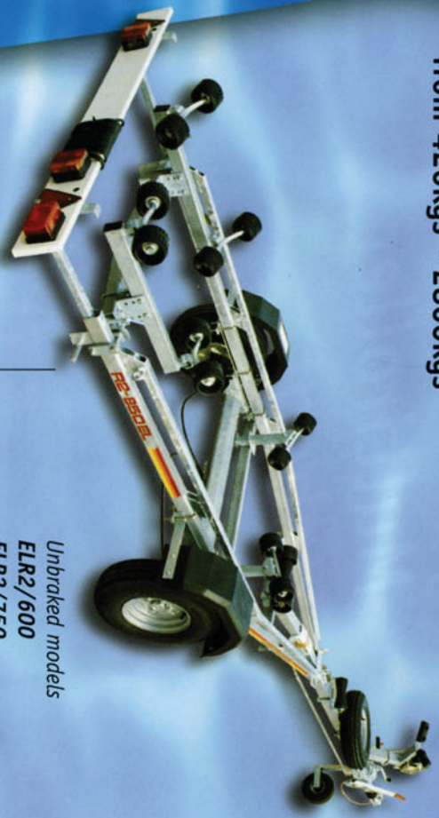
Unbraked models ELR2/600 ELR2/750 Braked version model ERL2/850 illustrated Spare wheel optional extra.