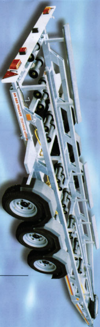
We can make trailers up to 6 tons gross with air brakes.

The above illustration is an R2/1800B with roller rear bunks.