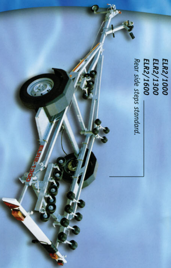
ELR2/1000 ELR2/1300 ELR2/1600 Rear side steps standard.