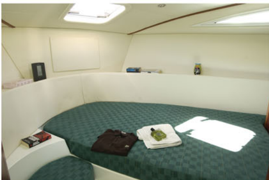
Queen Size V-Berth